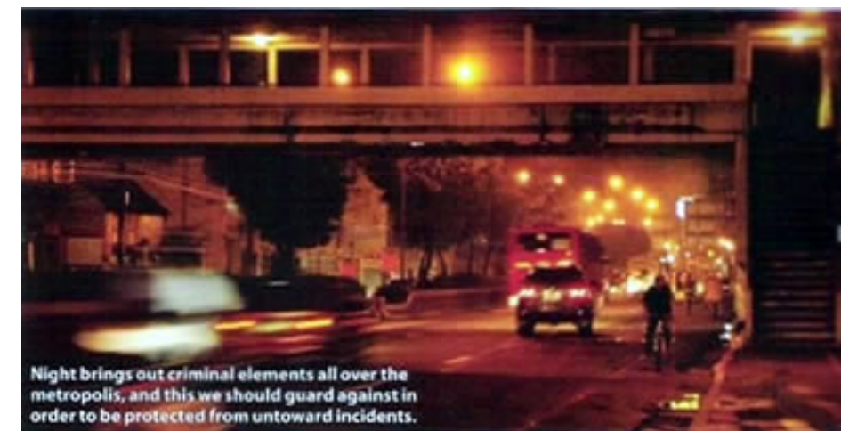
Night brings out criminal elements all over the metropolis, and this we should guard against in order to be protected from untoward incidents.

Make no mistake about it, gangs are operated by dark business strategists, who will give “promotional” packages to students, offering to support their drug habits for free if they bring in ten new customers (usually from the ranks of our naïve and unsuspecting youth). What follows is an all-too-typical chain of events that destroys families and further contributes to street crime. The drug user will begin to fail in school, his