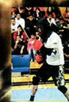
SALTIKAN NO ARMOR STICKFIGHTING