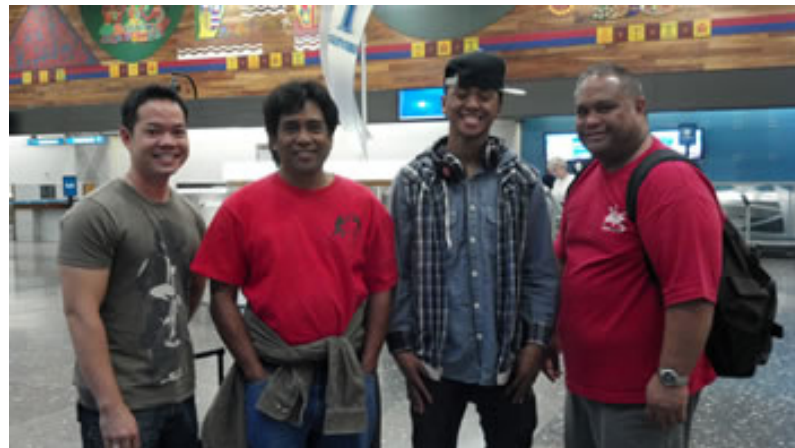
BDPH leaving to compete in the Nationals

and all of our team. Seeing the Filipino martial arts being perpetuated and celebrated by people from many backgrounds at all age levels made me proud to be part of the rich cultural traditions of the Philippines.