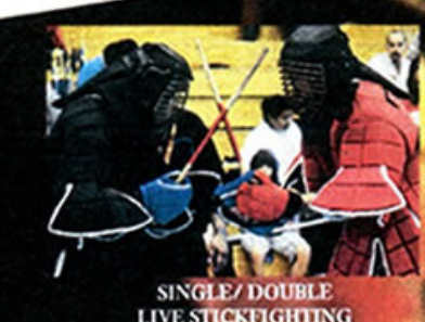
SINGLE/ DOUBLE LIVE STICKFIGHTING