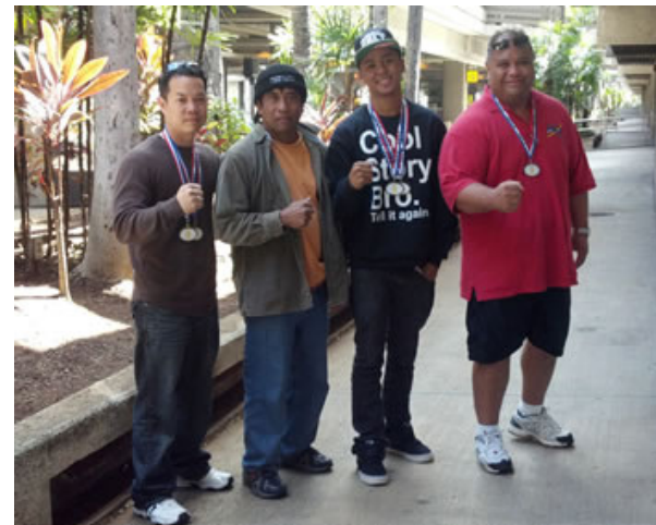
BDPH return to from the Nationals winners