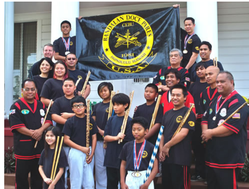
Bandalan Doce Pares Hawaii