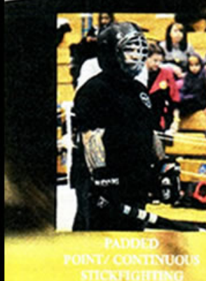
PADED POINT/ CONTINUOUS STICKFIGHTING

PADED POINT/ CONTINUOUS SPARRING * SINGLE/ DOUBLE LIVE STICKFIGHTING * SAYAW/ CARENZA * SALTIKAN/ KNIFE